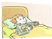
have a rest

Can you make more phrases? Tip See page 90.